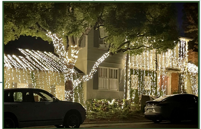
Lighting the way for Santa on Pinecrest Terrace