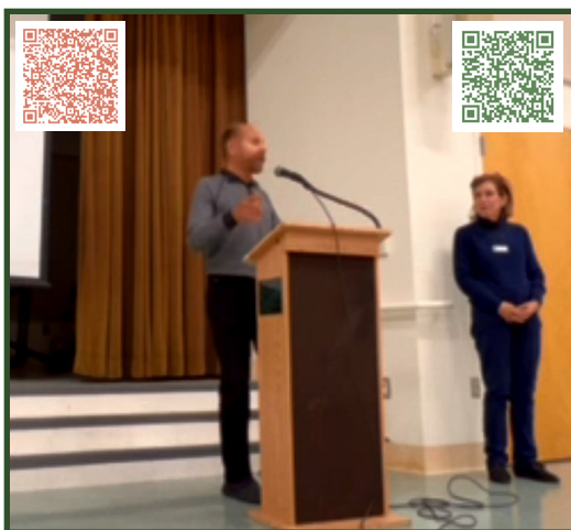
A collegial discussion of different approaches to funding San Mateo’s Storm Water challenges