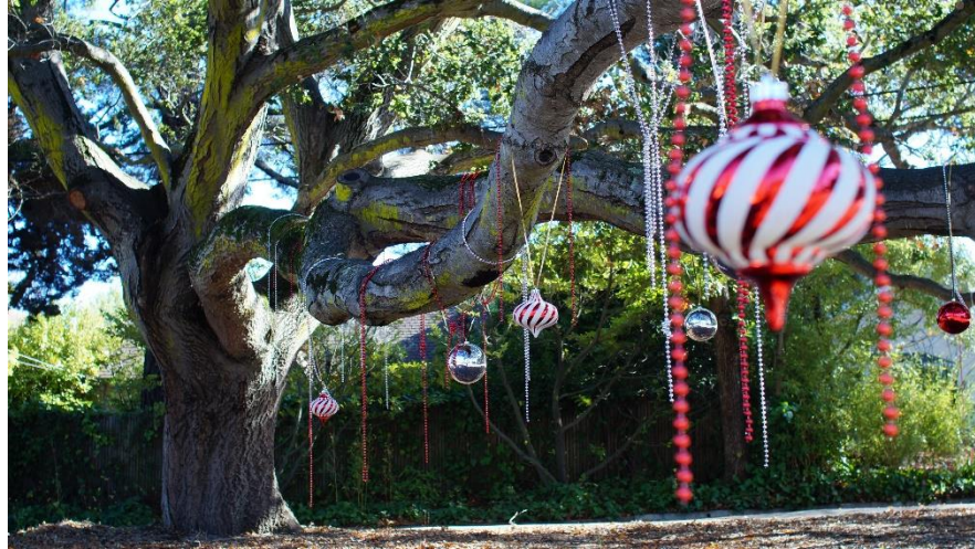
'Tis the season on an Occidental island

In our May newsletter (available on the website), we recognized the founding donors to the new Tree Fund. Since then, $10,425 has been added, including 7 donors contributing more than $1,000.