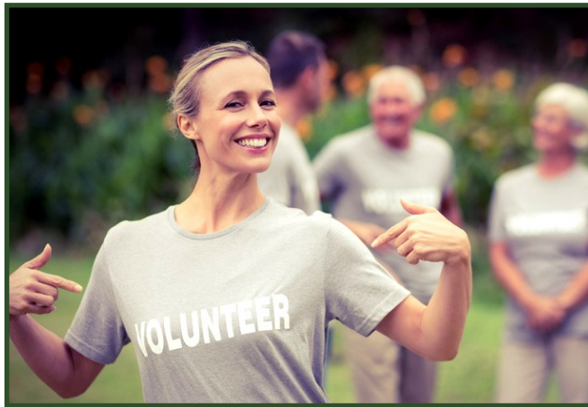
Little known fact: Neighborhood volunteering makes us all more youthful and beautiful. No? Well, at least it can't hurt...