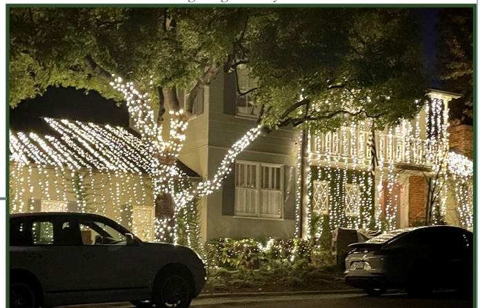
Lighting the way for Santa on Pinecrest Terrace